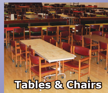
Tables & Chairs