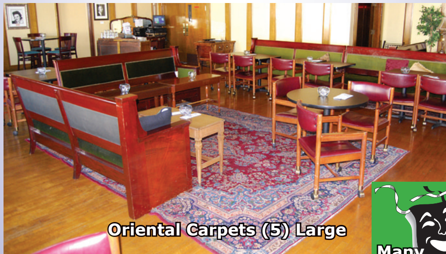
Oriental Carpets (5) Large