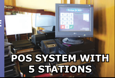
POS SYSTEM WITH 5 STATIONS

Terms of Payment: Cash, Good Checks, Credit Cards Visa/ MC