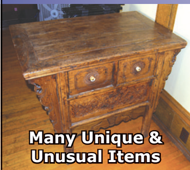
Many Unique & Unusual Items