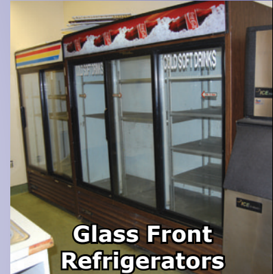
Glass Front Refrigerators