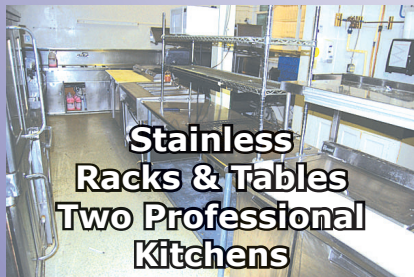
Stainless Racks & Tables Two Professional Kitchens