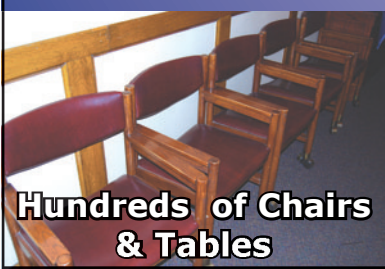
Hundreds of Chairs & Tables

CONDUCTED BY ORDER OF THE BOARD OF DIRECTORS OF CENTERSTAGE BY SILVER AUCTIONS