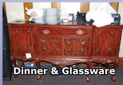
Dinner & Glassware