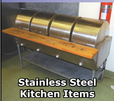
Stainless Steel Kitchen Items