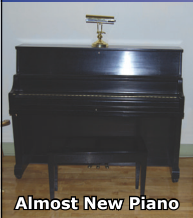
Almost New Piano

EVERYTHING SOLD TO HIGHEST BIDDER! NO MINIMUMS!