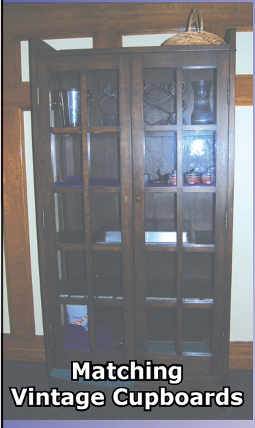
Matching Vintage Cupboards